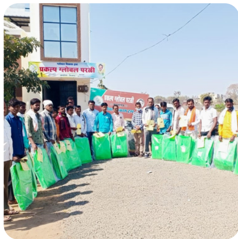
Farmers with the Global Parli team in Marathwada during vermi-bed distribution.

Almost all our farmer have expressed their interest in this initiative to enrich their soil.